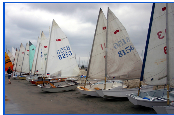
HBSF sabots ready for Beach-to-Bay regatta