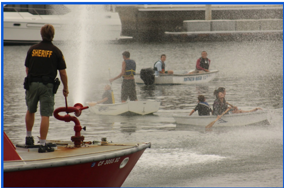
HB Harbor Patrol cools the kids